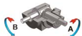
Rotazioni forma costruttiva TIPO 2 TYPE 2 constructive form revolutions