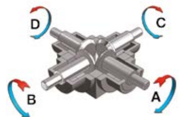
Rotazioni forma costruttiva TIPO 31 TYPE 31 constructive form revolutions